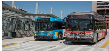
The new Silver Spring Transit Center