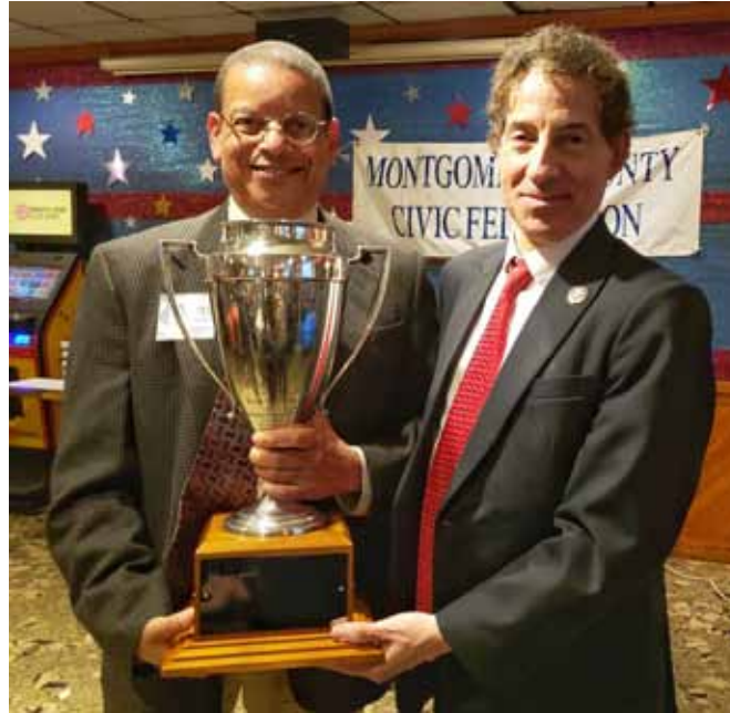
ALAN BOWSER (LEFT) IS PRESENTED WITH 2019'S STAR CUP BY U.S. REPRESENTATIVE FOR MARYLAND JAMIE RASKIN

Sponsored by The Montgomery Sentinel newspaper and awarded to an individual or group for a significant contribution to good government at the local level.