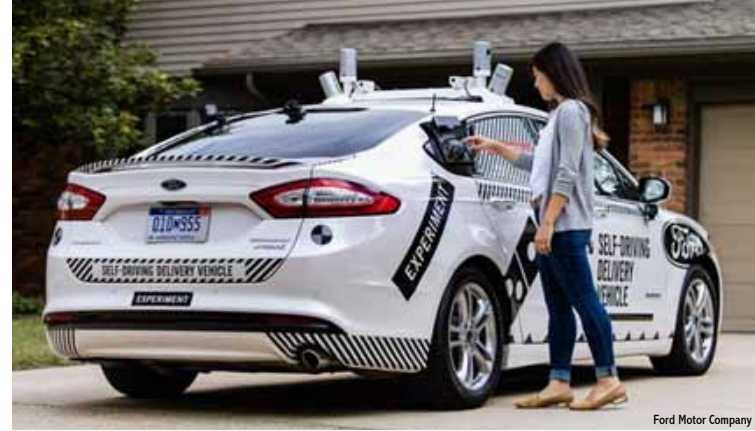
Ford Motor Company

Considering the current rancor and divisiveness in Congress concerning the many competing issues for its attention, the display of universal support for hurrying the implementation of self-driving vehicles in this country may only be exceeded by the Congressional enthusiasm for a Happy Mothers' Day proclamation.